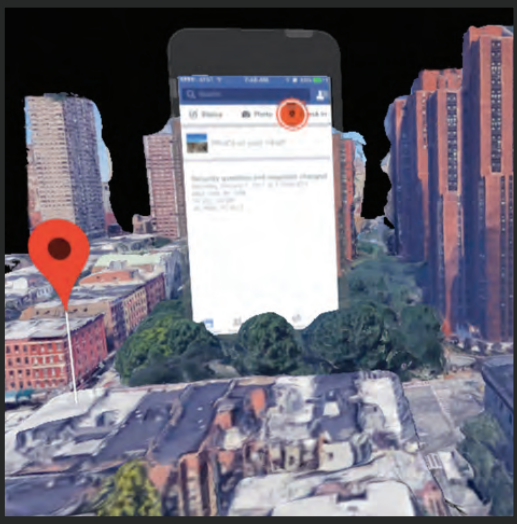
Logged In From by Becca Ricks, 2017

The trails of data we leave online plug us into categories that can shape—and potentially limit—who we think we are. Social platforms and algorithms are exerting unchecked power over our bodies and behavior.